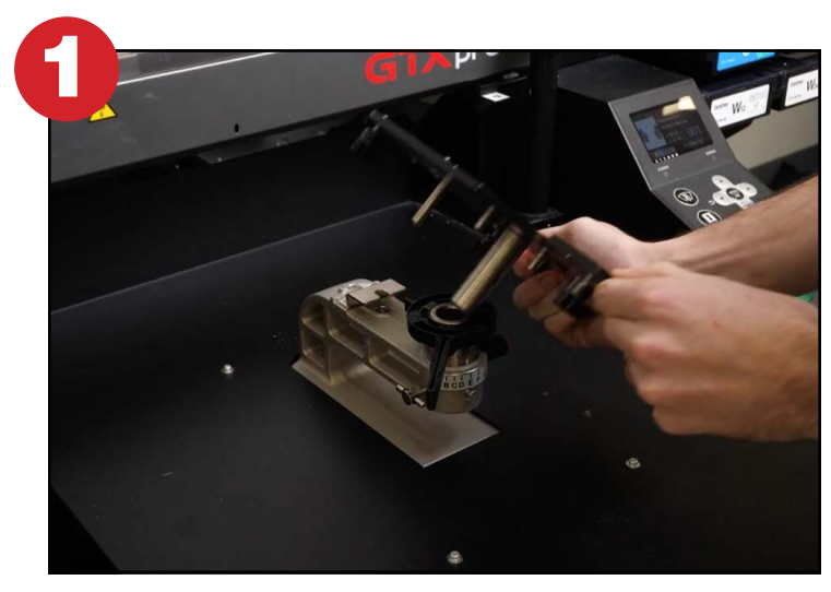
Step 1: Insert the T-Lock Base into the platen stem of the Brother DTG printer.

Below are instructions for installing the T-Lock Shoulder Insert on your T-Lock Platen Base.