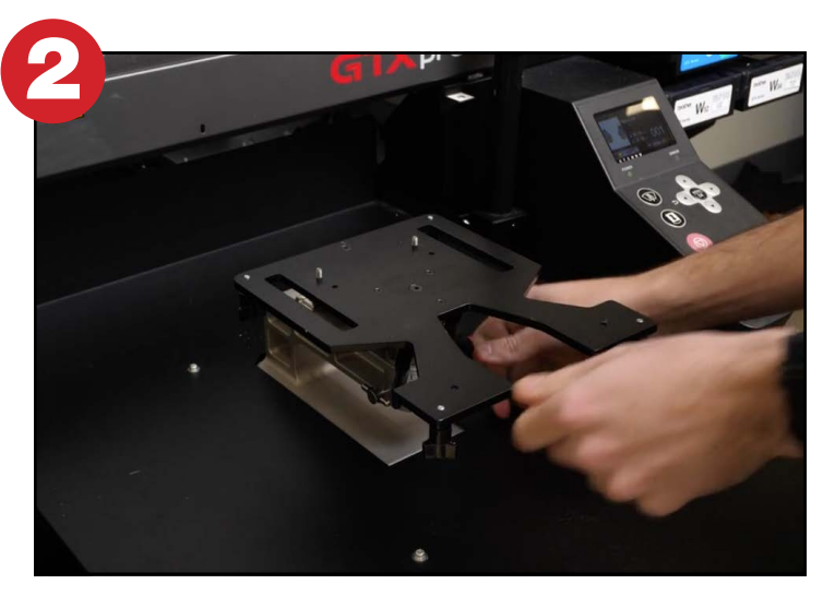
Step 2: Adjust the height of the platen and tighten the locking lever.