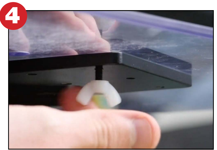
Secure the T-Lock Shoulder Insert using included bolts/wing nuts and predrilled holes on T-Lock Base.